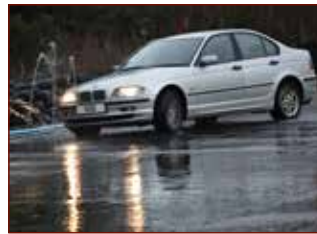
ABS Manual Transmission