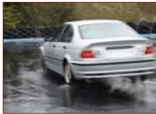
Front Wheel & Rear Wheel Drive

And having fun is all part of our ethos... a fun figure of 8 time trial will have everyone on the edge of their seat (literally) as the battle of speed against control results in hilarious outcomes.